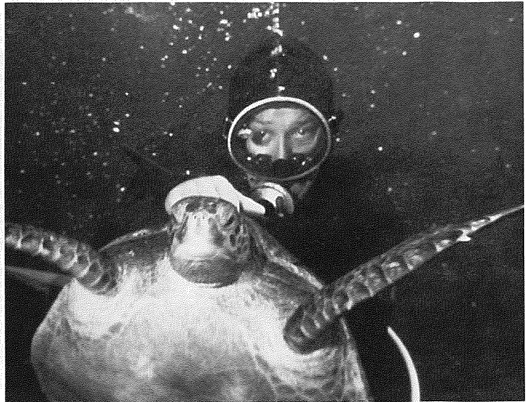
Fig. 2 (left). Fishermen hunting dormant sea turtles off the south shore of San Esteban Island, 23 January 1975. Note epizoophytic marine algae on carapaces and prehensile tail of large male Chelonia grasping gunwale. Also note plastic hoses, supplying divers with air, behind boat, and air compressor fastened to seat of boat. Fig. 3 (right). Mexican diver bringing dormant Chelonia to the surface from approximately 15 m depth, 23 January 1975, San Esteban Island.

Dormant turtles in the Infiernillo Channel (Fig. 1) now seem to be relatively scarce and are seldom hunted by the Seri.